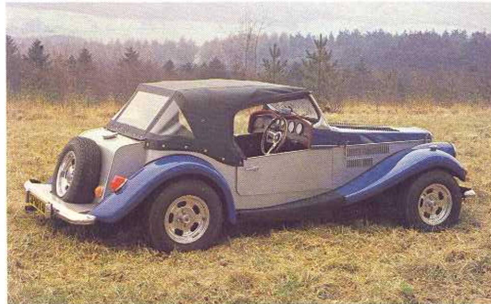
2 SEATER — Shown with side screens stowed in rear.